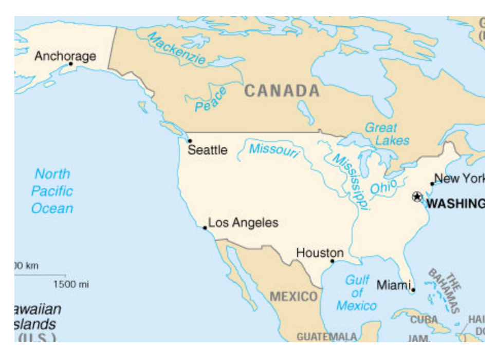
Figure 2: 'NA' Continent; Zone IP Address = '001'