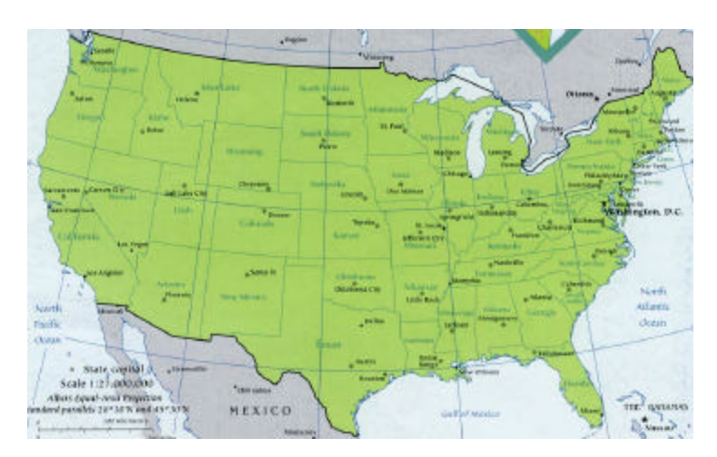
Figure 3: Different 'IP Area Code' Address for each State