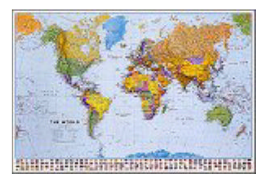
Figure 1; Visualizing the 'Zone IP' and 'IP Area Code' Addresses

This document, whose only objective was the explanation for the method(s) used in the Efficiency Determination of an IP Addressing Specification, and the development of a possible (Suggestion) "INTERNET PROTOCOL ADDRESS SPACE" for the 'IPt1 and IPt2 IP Addressing Specifications', which actually did not directly raise any security issues. Hence, there are no issues raised that warrant Security Considerations.