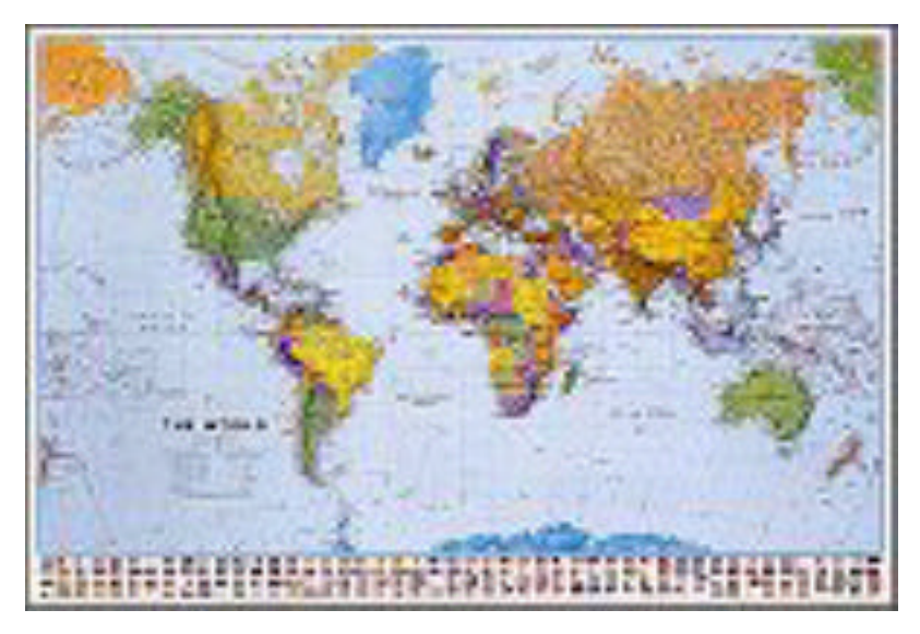
Figure 1; Visualizing the Zone IP and IP Area Code

This document, whose only objective was the explanation for the method(s) used in the Efficiency Determination of an IP Addressing Specification, and the development of a possible (Suggestion) "INTERNET PROTOCOL ADDRESS SPACE" for the 'IPt1 and IPt2 IP Addressing Specifications', which actually did not directly raise any security issues. Hence, there are no issues raised that warrant Security Considerations.