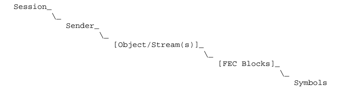
Fig. 2: NORM Data Content Identification Hierarchy

The format of NACK content will depend on the protocol's data service model and the format of data content identification the protocol uses. This NACK format also depends upon the type of FEC encoding (if any) is used. Figure 2 illustrates a logical, hierarchical transmission content identification scheme, denoting that the notion of objects (or streams) and/or FEC blocking is optional at the protocol instantiation's discretion. Note that the identification of objects is with respect to a given sender. It is recommended that transport data content identification is done within the context of a sender in a given session. Since the notion of session "streams" and "blocks" is optional, the framework degenerates to that of typical transport data segmentation and reassembly in its simplest form.