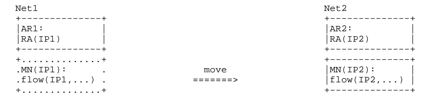
Figure 2. Changing the IP address. MN running a flow using IP1 in Net1 changes to running a flow using IP2 in Net2.